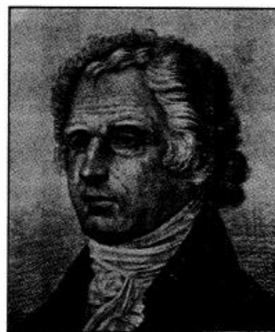
Dmytro Bortniansky (1751-1825)

Колекціонерське видання "35 Духовних хорових концертів" можна замовити по зниженій ціні, $55.00, до 31-го грудня, 1988. Від першого січня 1989 р. комплект буде коштувати $65.00. По дальшій інформації або замовити комплект концертів, прошу пишати до найближчого відділу Фундації Тисячоліття Хрещення України або до Українського Центру Засобів і Розвитку. Телефон: (403)483-4422.