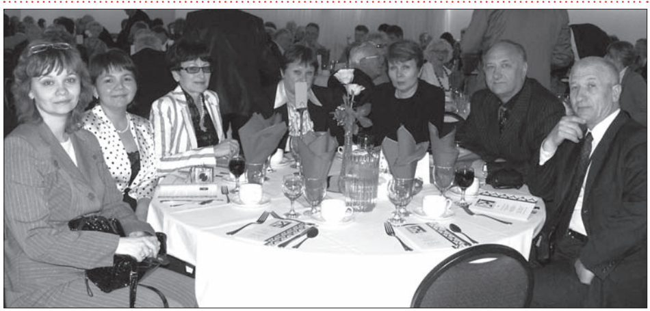
Kyiv Konnection banquet; visitors from Ukraine