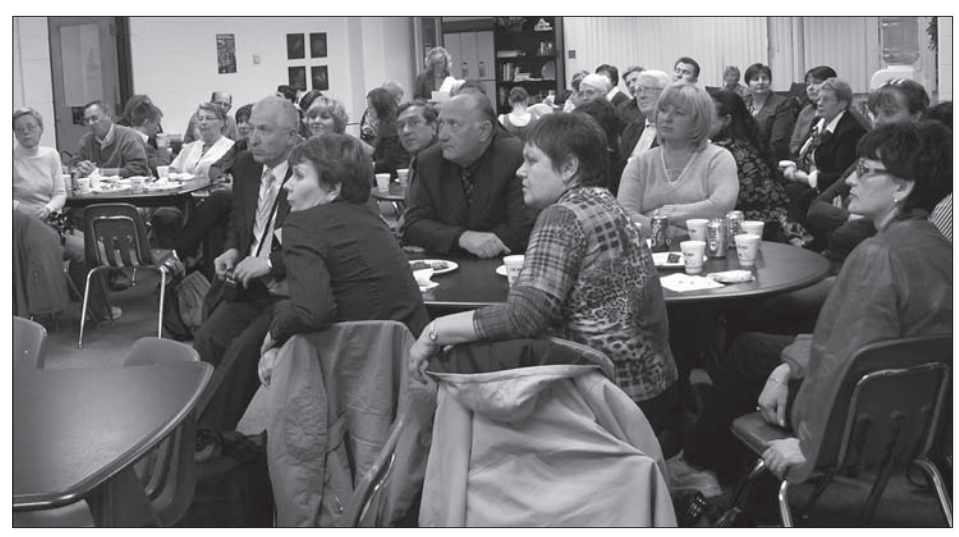
Meeting with Alberta parents