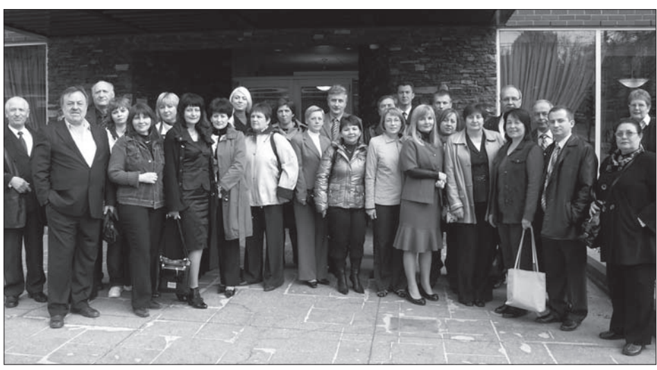
May 2009 Study Tour to Canada, Inclusive Education in Ukraine project