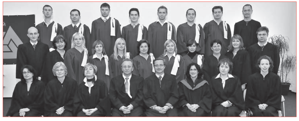
MacEwan IIB program graduation, Kyiv, Ukraine

However, it was not "all work and no play" for the trio. During their visit, they also had an opportunity to attend festivals, visit tourist sites such as the Royal Alberta Museum and the Legislature Building, travel to the Rockies and visit many homes. They extend a sincere "thank you" to everyone who assisted them and hosted them throughout their visit to Alberta, which they call the kindest and friendliest place they have ever visited.