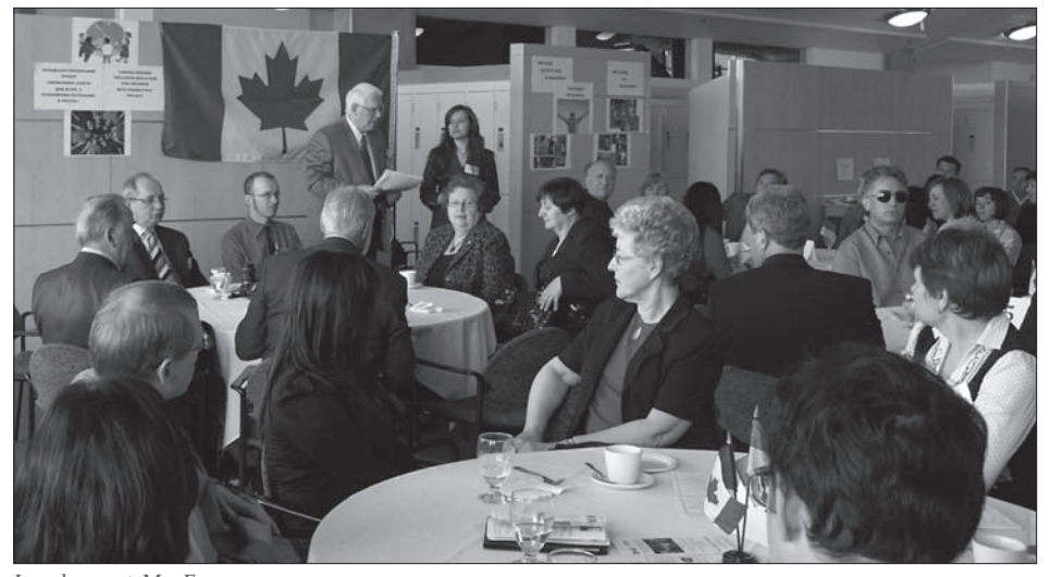
Luncheon at MacEwan