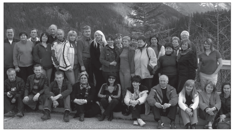
May 2009 Study Tour to Canada

Over the course of five years (2008-2013) the project is being implemented within two pilot regions in Ukraine: