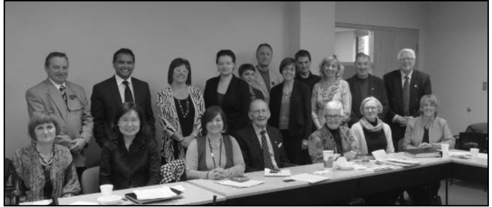
Saskatoon Health Symposium attendees

In 2009, the University of Saskatchewan (U of S) in Saskatoon