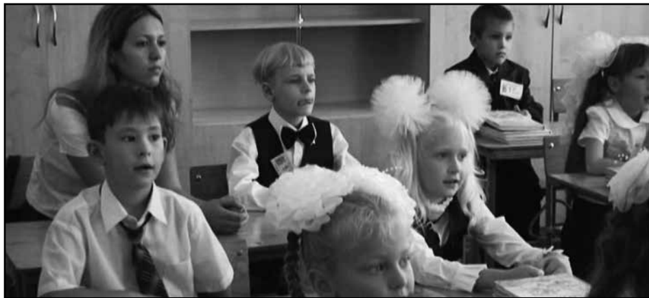
A special needs student from Simferopol, is supported by a teacher assistant

In Year 5 of the project, the focus has been on ensuring sustainability of programming results and implementing a successful exit strategy. Part of that included the development of a 54-hour course called "Fundamentals of Inclusive Education" for the pre-service teacher preparation programs. It was approved by the Ministry, and in May 2012 was introduced at the project seminar in Simferopol and to representatives of all pedagogical universities from across Ukraine. The course comes in a package with methodological guidebooks and