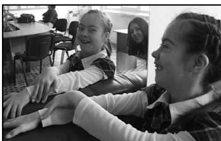
A special needs student from Simferopol is enjoying a break