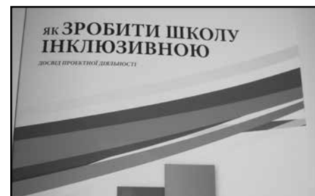
Ukrainian guidebook on how to make schools inclusive