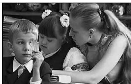
A special needs student from Lviv is supported by a teacher assistant.