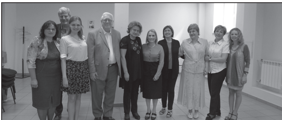
MacEwan delegation with partners from NaUKMA and TSMU at the seminar dedicated to the Social Aspects of Conflict