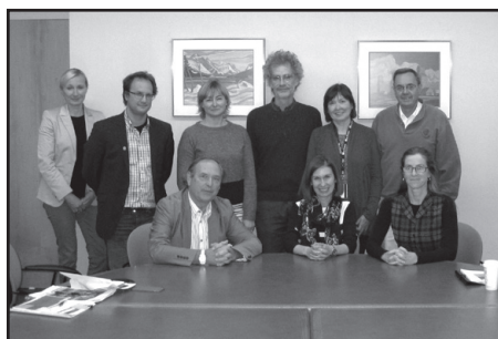
URDC Advisory Meeting